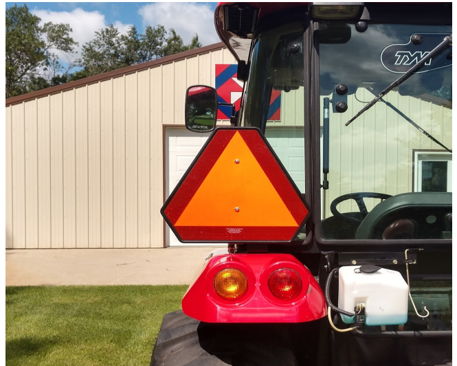
Visible Up To 1000 Feet Away

Permits and escort vehicles are not required when farm equipment is being transported on a municipal road, being towed behind a vehicle or if self-propelled. Although escort vehicles are not a requirement they provide a greater level of visibility so the motoring traffic can prepare and slow down, follow or pass farm equipment. Over-dimension signs, slow moving vehicle signs and flashing beacons are highly recommended by the RM when moving any type of farm machinery on municipal roads and especially after dark.